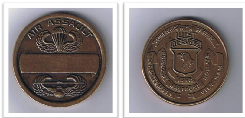
Air Assault 101 st Airborne Challenge Coin